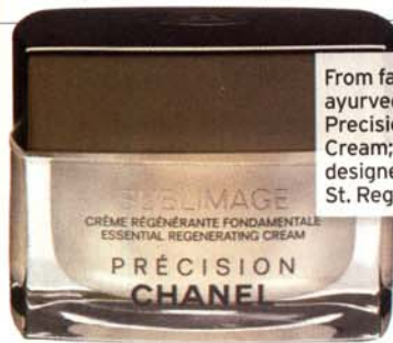
From far left: Charym's ayurvedic oils; Chanel's Precision Sublimage Cream; a Champalimaud-designed lounge at the St. Regis Beijing.